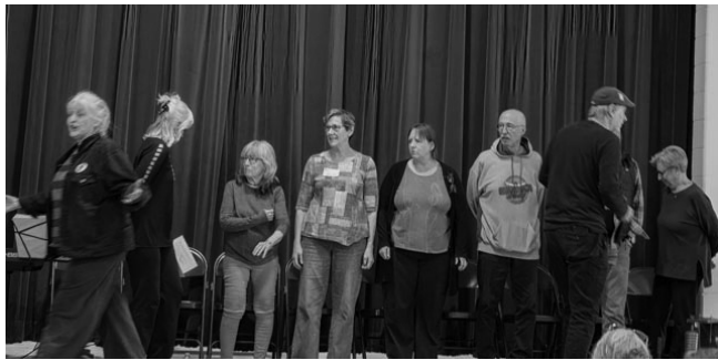
Audience Improvisation

to make a difference. They talked about the importance of local politics – filling out the census, attending town meetings and participating in town elections. All of it is democracy in action, they emphasized, and should be celebrated, not ignored.