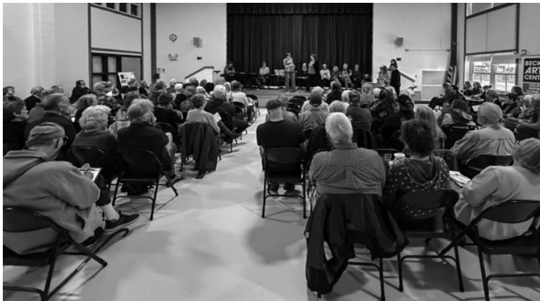
Audience at the Forum

The Becket Washington Elementary School (BWS) auditorium was bursting with town pride and joy at the Two-Town Forum held on May 4th from 6 to 8 pm. With over 140 participants, what portended to be a humdrum event turned out to be a celebration of democracy, civic engagement and believe it or not, the town census!